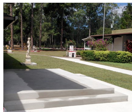
Piazza renovations underway.

Meanwhile plans are being drafted for Stage 2 of our redevelopments – the New Italy Museum. Since this work will impact upon the café (during construction and in the final situation) consideration is now being given to the concept of redeveloping/ redecorating the whole of the inside of the building, rather than just the museum end. Since the number of decorative, change and improvement options available is somewhat limitless, plans are still being drafted and expert opinion sought. It is however expected that a start will be made later in the year.