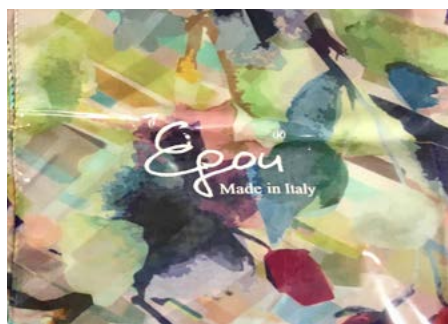
A small sample of the range of fine silk scarves available at the Gift Shop.

We have been very fortunate to find a company in Milan, the fashion capital of the world, who make fine Italian silk scarves. Our first shipment sold out. Our second shipment is due in at the end of the month. The scarves come in three sizes from square to shawl style in vibrant colours and patterns. We will also be stocking some Italian modal scarf/shawls.