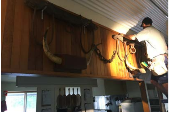
Jim Barnes installing the New Italy Museum's bullock team artefacts in the Café.

Work progresses... We hope to have 65% of the museum complete by the end of 2017. It is a big job relying on the expertise, local knowledge and commitment of a dedicated team.