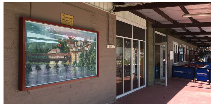
Top: The proposed design of the new café screen. Bottom: The museum/café verandah has four paintings by Florian Volpato

A lot has been happening inside and outside of the Museum recently. Much sifting and gathering of New Italy family photos has enabled the preparation of a large wall graphic and display recognising the first families in the New Italy community.