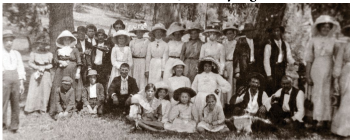
An earlier New Italy gathering - note the hats!