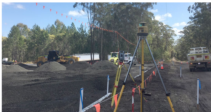
The new car park takes shape down Swan Bay-New Italy Road