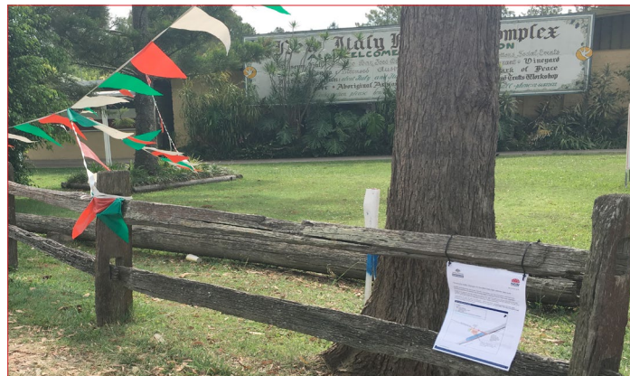
The heritage post rail fence has been relocated and stored awaiting a new life in the Park of Peace while Florian Volpato's billboard will add to New Italy's story in the Italian Pavilion.

With the above situation in mind it has been decided to concentrate our efforts on the highway side appearance of the site in readiness for the completion of highway works in our area by early 2020. Firstly, the heritage post/rail fencing has been stored for later reinstallation in the Park of Peace. We have received a small grant to develop a site plan assisted by our architect Heike Seubert. This will include the redevelopment of the tower and the eastern entrance of the site. Heike will be providing plans for the construction