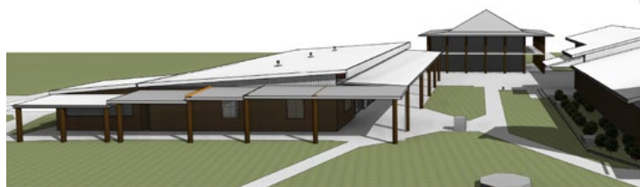
3D VIEW MUSEUM COURTYARD WITH AWNINGS

The DA has been submitted! We look forward to creating a safe, welcoming and sheltered entrance that will reflect the style of the café terrace and Osteria to the site from the front carpark, past the old Driver Reviver and in front of the Museum.