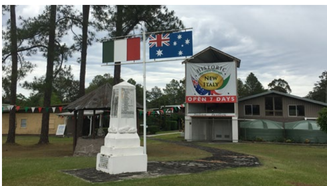
The New Italy Monument in front of the Pavilion. Note the fresh new banner on the Pavilion Tower.

NIMI approached Queensland Heritage Masonry P.L. to visit the site, inspect the monument and produce a conditional report of the New Italy Monument and the possibilities for its conservation. It was deemed by them that "the New Italy Memorial is in sound condition, well proportioned and solidly constructed, the lead inscribed marble panels are significantly stained along with chipped and damaged render detracting considerably from the overall appearance of the monument. The rendered concrete structure has been well executed and the Carrara marble lead inscriptions are well done by a competent stonemason. It is the opinion of Queensland Heritage Masonry that this monument should be preserved in its current position with the necessary conservation works carried out in the short term to improve the overall appearance of the monument."