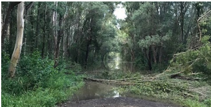
Swan Bay-New Italy Road. Compare to 1919 version in the Museum Report.