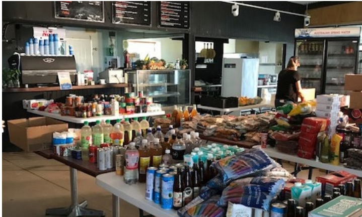
The Tastes of New Italy Café became a food distribution hub