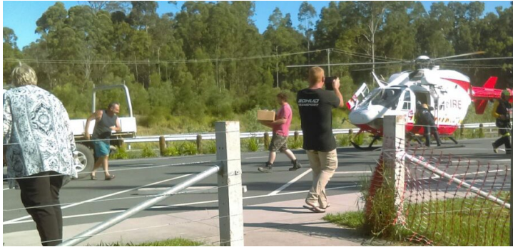
Helicopter and emergency food drop in front car park at Historic New Italy