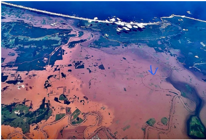
Aerial view of flood inundation featuring Evans Head